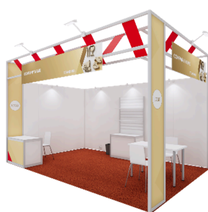
Exhibit Now 立即參展