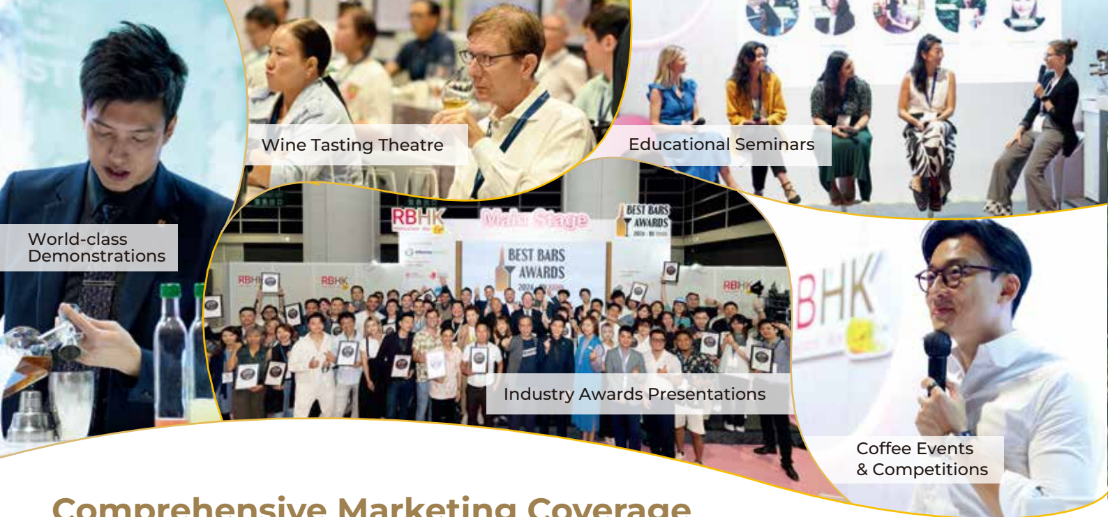
Wine Tasting Theatre